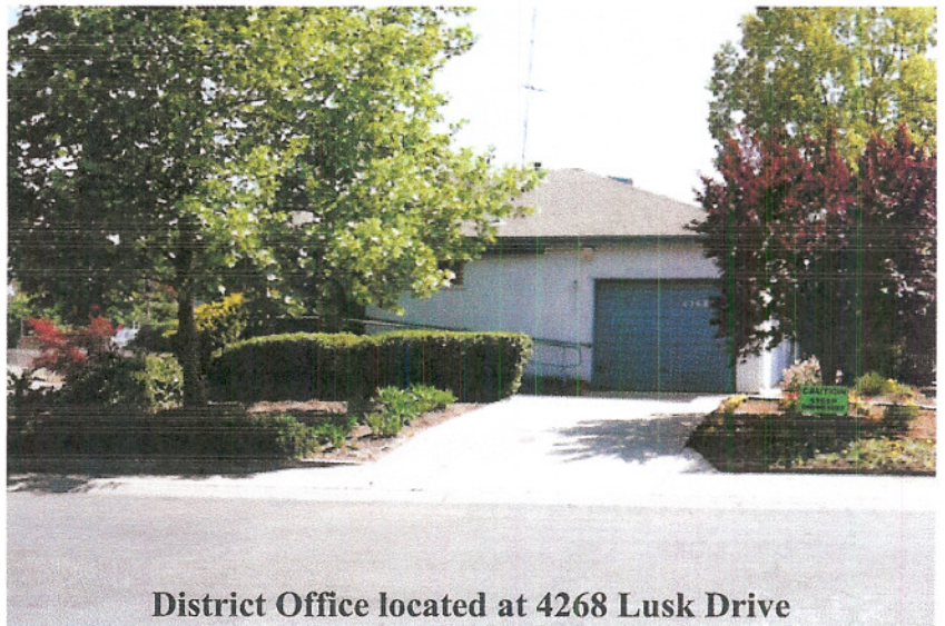
District Office located at 4268 Lusk Drive

In order to ensure that tap water is safe to drink, the U.S. Environmental Protection Agency (USEPA) and the California Department of Public Health (CDPH) prescribe regulations that limit the amount of certain contaminants in water provided by public water systems. The CDPH regulations also establish limits for contaminants in bottled water that provide the same protection for public health.